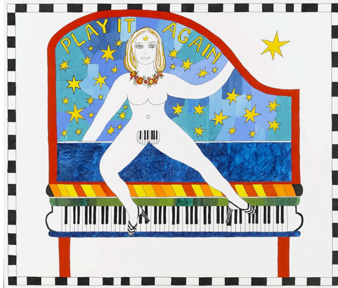
Dorothy Iannone, Play It Again (2007)