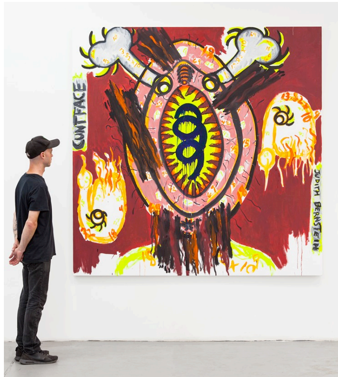
Judith Bernstein, Cuntface Red (2015)

When Venus Over Los Angeles titled its summer show of six female artists “CUNT,” a sort of low buzz began among female art worlders in L.A.